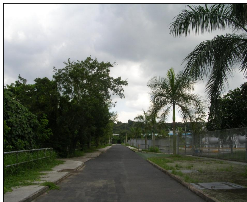
From GIC3 Workers at Man Kam To Pumping Station