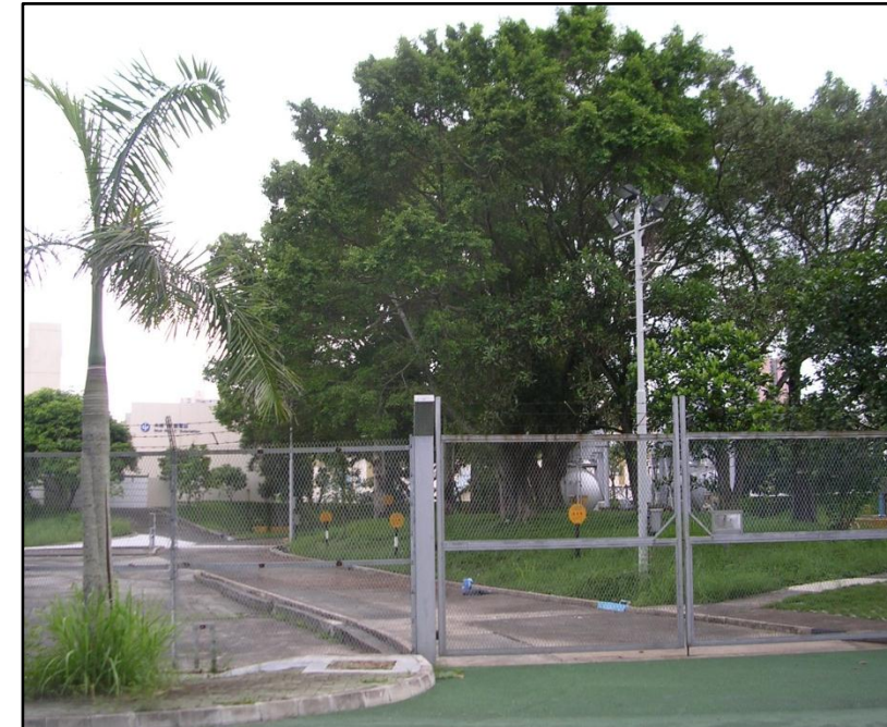
To GIC3 Workers at Man Kam To Pumping Station