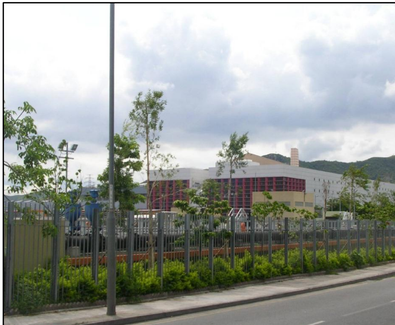
To GIC2 Workers at Water Treatment Works