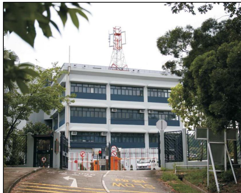
To GIC1 Workers in Border District Police Headquarters